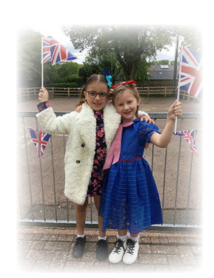
VE Day Celebrations KS1 Street Party